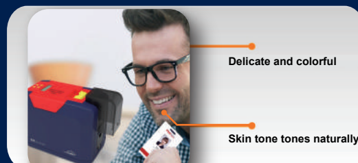
High quality photo processing by Dye sublimation technology

Dual interface card encoding module Contactless ID Card encoding module UHF chip card encoding module Magnetic stripe card encoding module